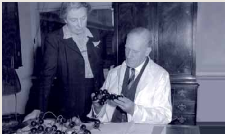
Answer: Sir Robert Robinson in his Oxford laboratory watched by his wife, also a scientist. He is examining a model of the strychnine molecule (no date).